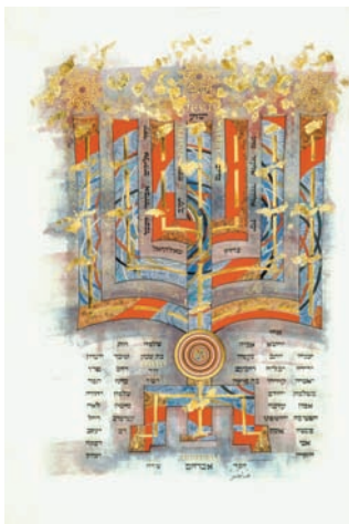
Life of Paul

"The Saint John's Bible incorporates many of the characteristics of its medieval predecessors: it was written on vellum using quills, natural handmade inks, hand ground pigments and gild such as gold leaf, silver leaf and platinum. Yet, it employs the modern, English translation the New Revised Standard Version (NRSV) as well as contemporary scripts and illuminations."